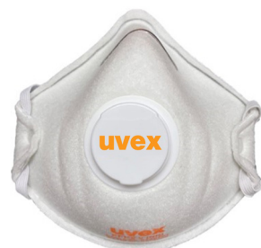
Product code 8799701