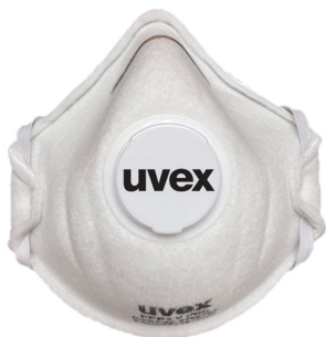
Product code 8799703