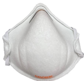
Product code 8799700