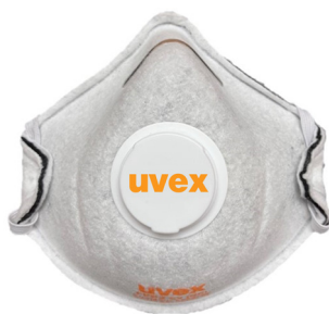
Product code 8799702