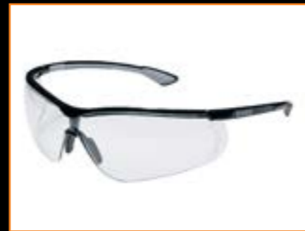
Feather-light with a weight of only 23 grams uvex sportstyle are significantly lighter than conventional safety spectacles giving optimised optical clarity and no pressure when wearing both products.