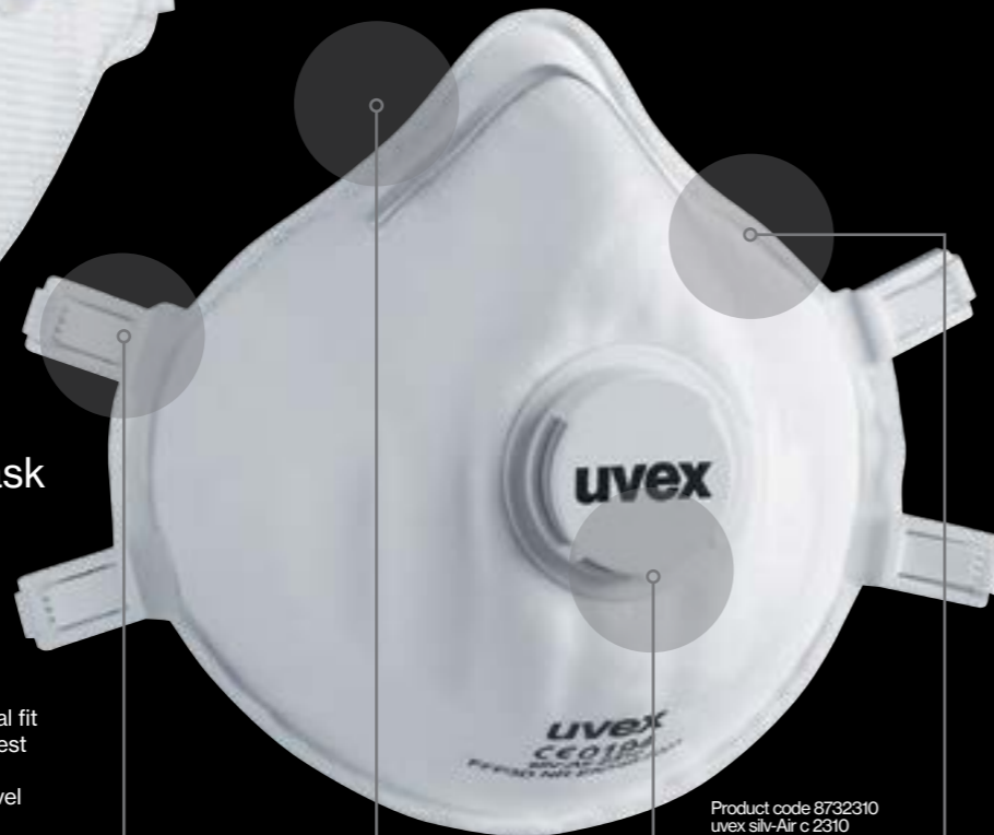
Product code 8732310 uvex silv-Air c 2310