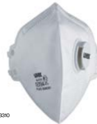
Product code 8763310