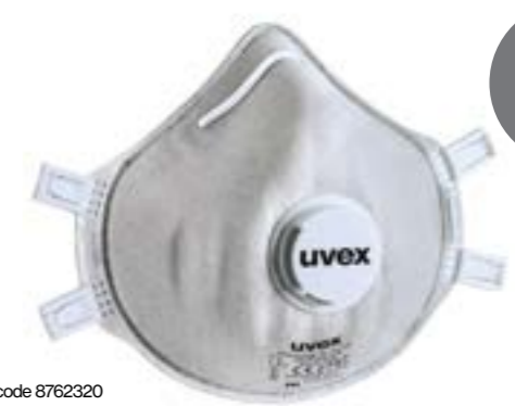
Product code 8762320