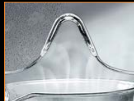
uvex unique anti-fog lens coating keeps the lens fog-free particularly during strenuous activity when body heat can intensify while wearing a mask. Applied to both sides of the lens.