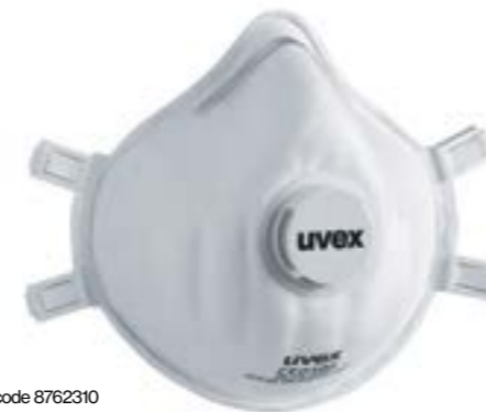
Product code 8762310