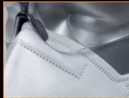
The 3D preformed mask shape gives an exceptional mask/face seal and the lens curvature reduces any gap between the eyes and the spectacle.