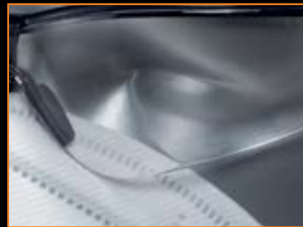
The spectacle lens sits outside of the mask ensuring no downward pressure dislodging the mask position.

* Alternative spec or goggle and mask options are available.