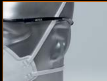
The low profile headband and ultra lightweight thin spectacle arm combination enhances compatibility with other items of PPE such as ear defenders and helmets.