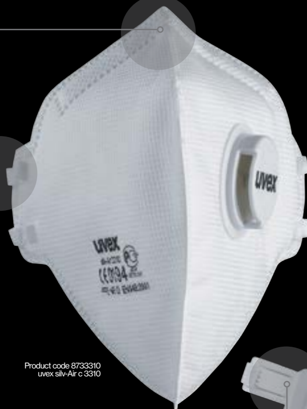
Product code 8733310 uvex silv-Air c 3310