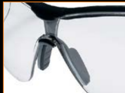
The uvex sportstyle boasts an adjustable nose piece and soft anti-slip ear pieces (uvex duo component technology) ensuring a pressure-free fit. The wearer is able to maintain the exact position of the spec and mask even during strenuous tasks.