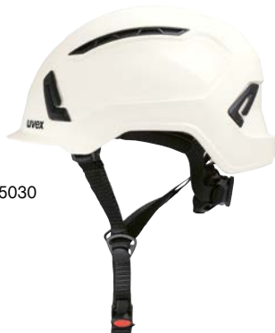
Art. no. 9735030