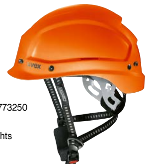
Art. no. 9773250