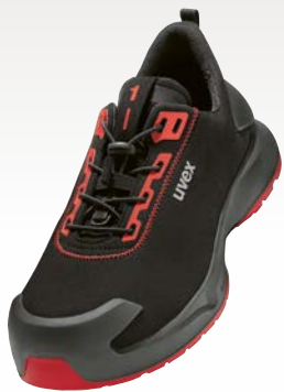
Art. no. 68032

Additional foot protection models can be found at uvex-safety.com/en/products/safety-shoes or simply scan the QR code