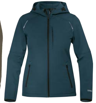
Art. no. 70366