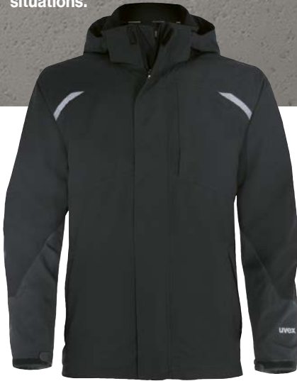
Art. no. 88743