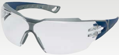
uvex pheos cx2 clear, blue/grey