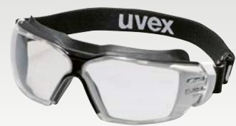
uvex pheos cx2 sonic clear, white/black