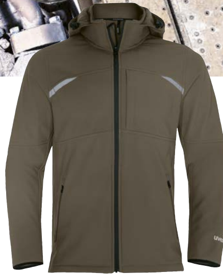
Art. no. 88824