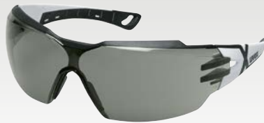
uvex pheos cx2 tinted grey, white/black