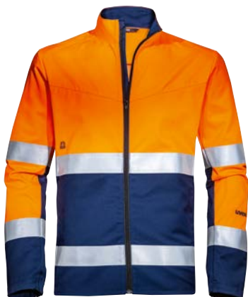
Art. no. 88265

Art. no. 88265 ■ high-vis orange 88266 ■ high-vis yellow