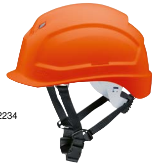
Art. no. 9772234