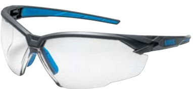
uvex suXXeed clear, anthracite/blue