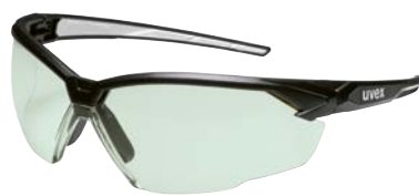
uvex suXXeed tinted light green, black/light grey