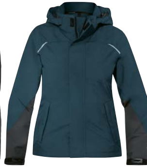
Art. no. 70364