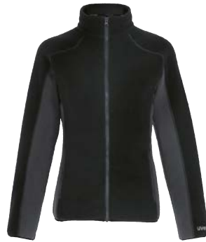
Art. no. 88857