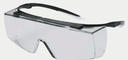
uvex super f OTG clear, black/clear