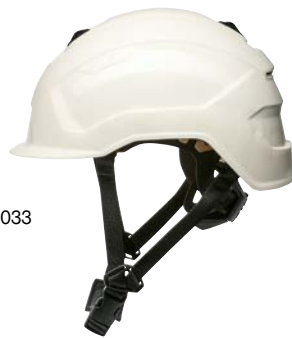
Art. no. 9731033