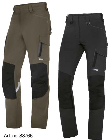
Art. no. 88766