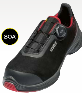
Art. no. 68402