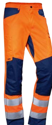
Art. no. 88267

Art. no. 88308 ■ high-vis yellow 88309 ■ high-vis orange