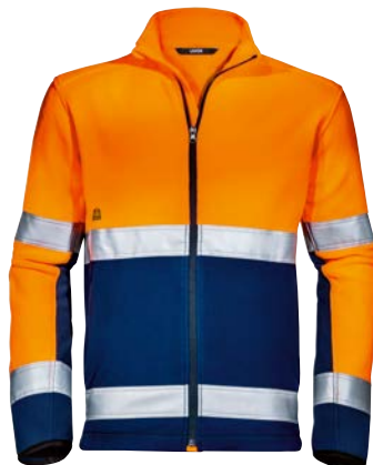
Art. no. 88309

Art. no. 88265 ■ high-vis orange 88266 ■ high-vis yellow