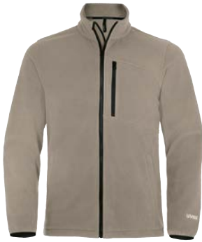
Art. no. 88932