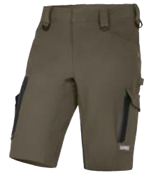
Art. no. 88786