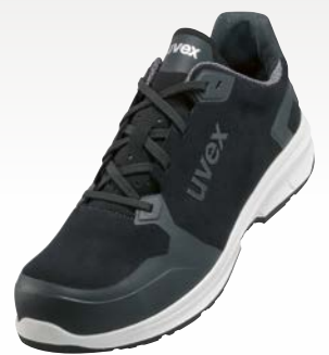
Art. no. 65962