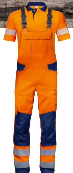
Art. no. 88269

Art. no. 88267 ■ high-vis orange 88268 ■ high-vis yellow