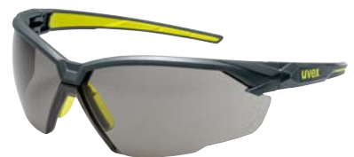
uvex suXXeed tinted grey, anthracite/lime