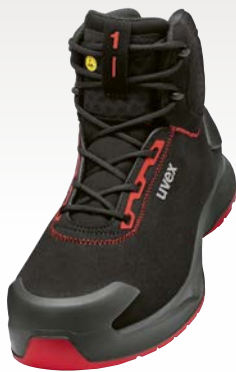
Art. no. 68042