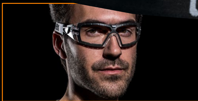
Compact design , ultra-light weight, wide-vision goggle (34g)