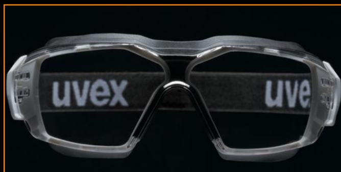
Scratch-resistant outside, anti-fog inside thanks to uvex supervision extreme coating