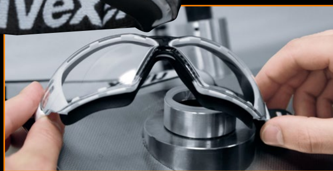
Outstanding protection thanks to flexibly adaptable soft components