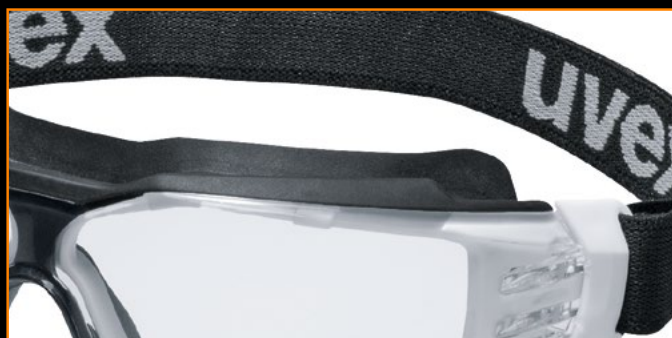
X-tended eyeshield for perfect coverage of the whole eye area