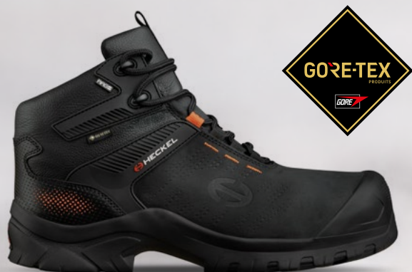
MACTRACK 3.0 GTX

ART. NO. 67643 | EN 20345 : 2022 S7L FO CI HI HRO SC SR | SIZES 36 - 48 (3.5 to 13)