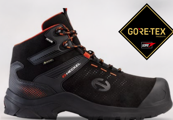
MACEXPEDITION 3.0 GTX

ART. NO. 67643 | EN 20345 : 2022 S7L FO CI HI HRO SC SR | SIZES 36 - 48 (3.5 to 13)