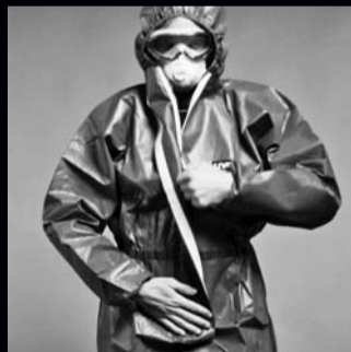
9. Close the coverall completely