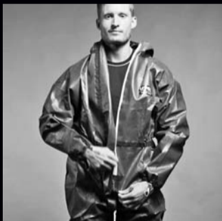
7. Close coverall up to the chest