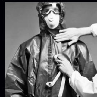
11. Smooth out coverall and seal flap with adhesive tape