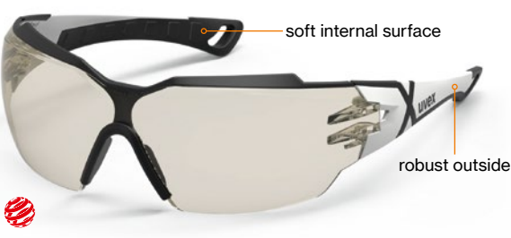
reddot award 2016 winner