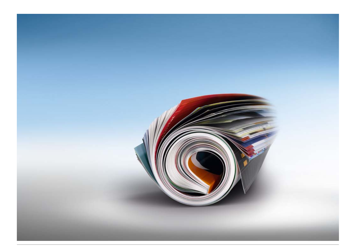
... requires no more energy than manufacturing the paper for your favourite weekly magazine. «