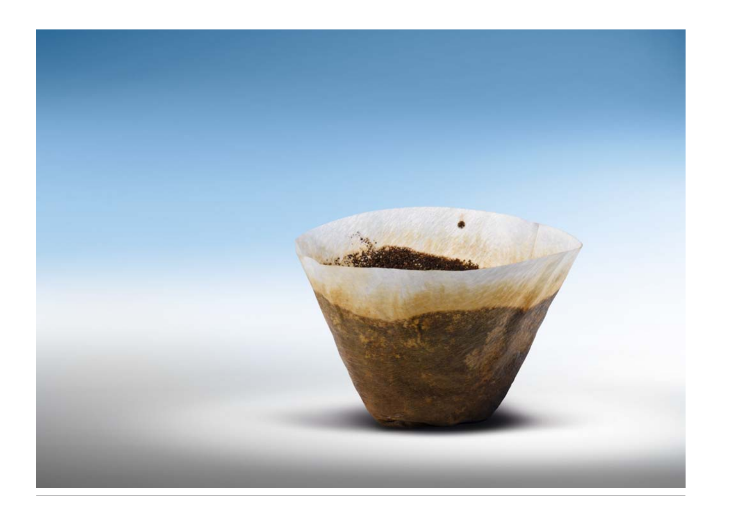
... generates no more waste than one full coffee filter. «