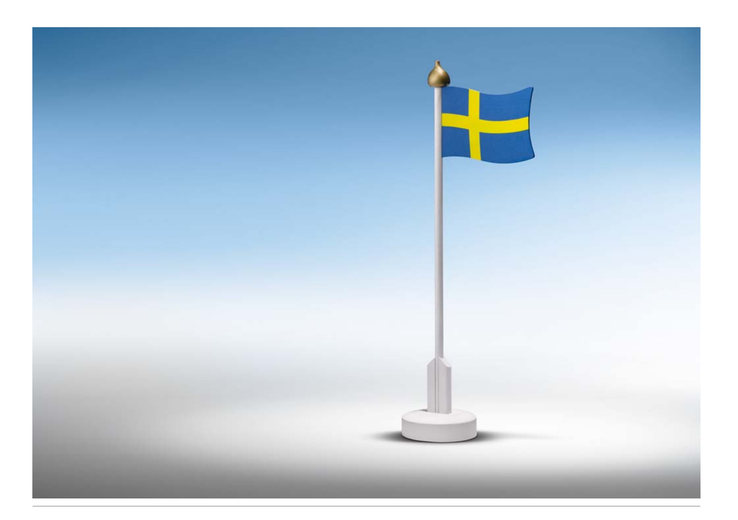
... involves short transport routes. «