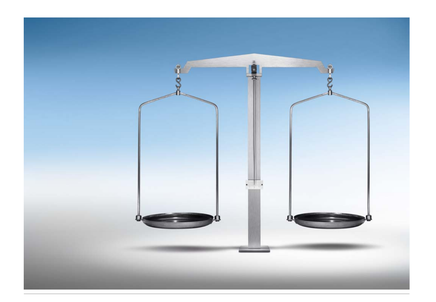
... provides opportunities for disadvantaged people. «