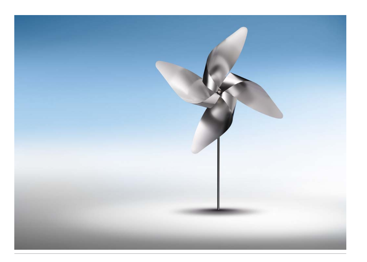
... does not leave a carbon footprint. We do not generate any CO<sub>2</sub> emissions. «