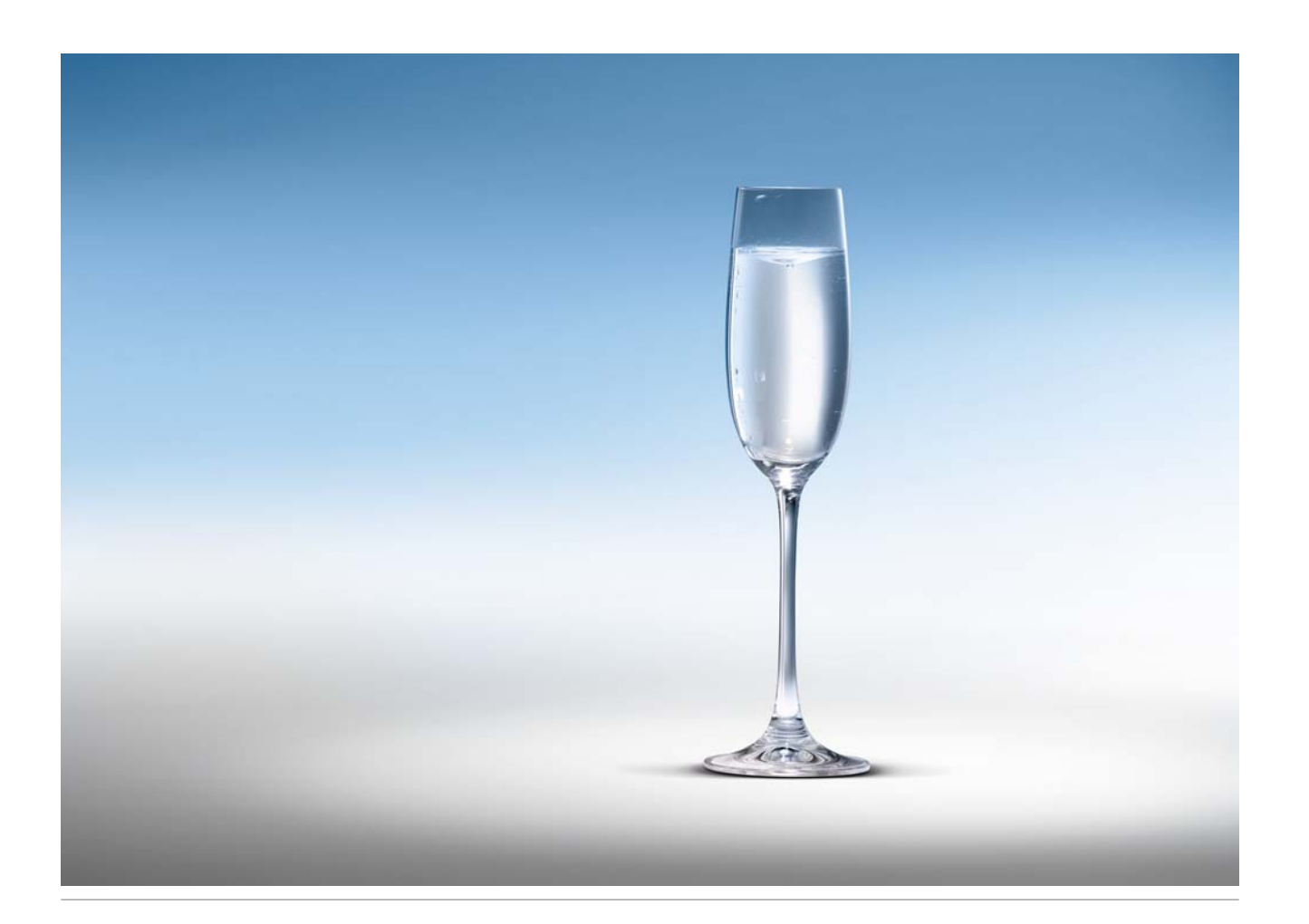
... requires no more than one champagne glass of water. «