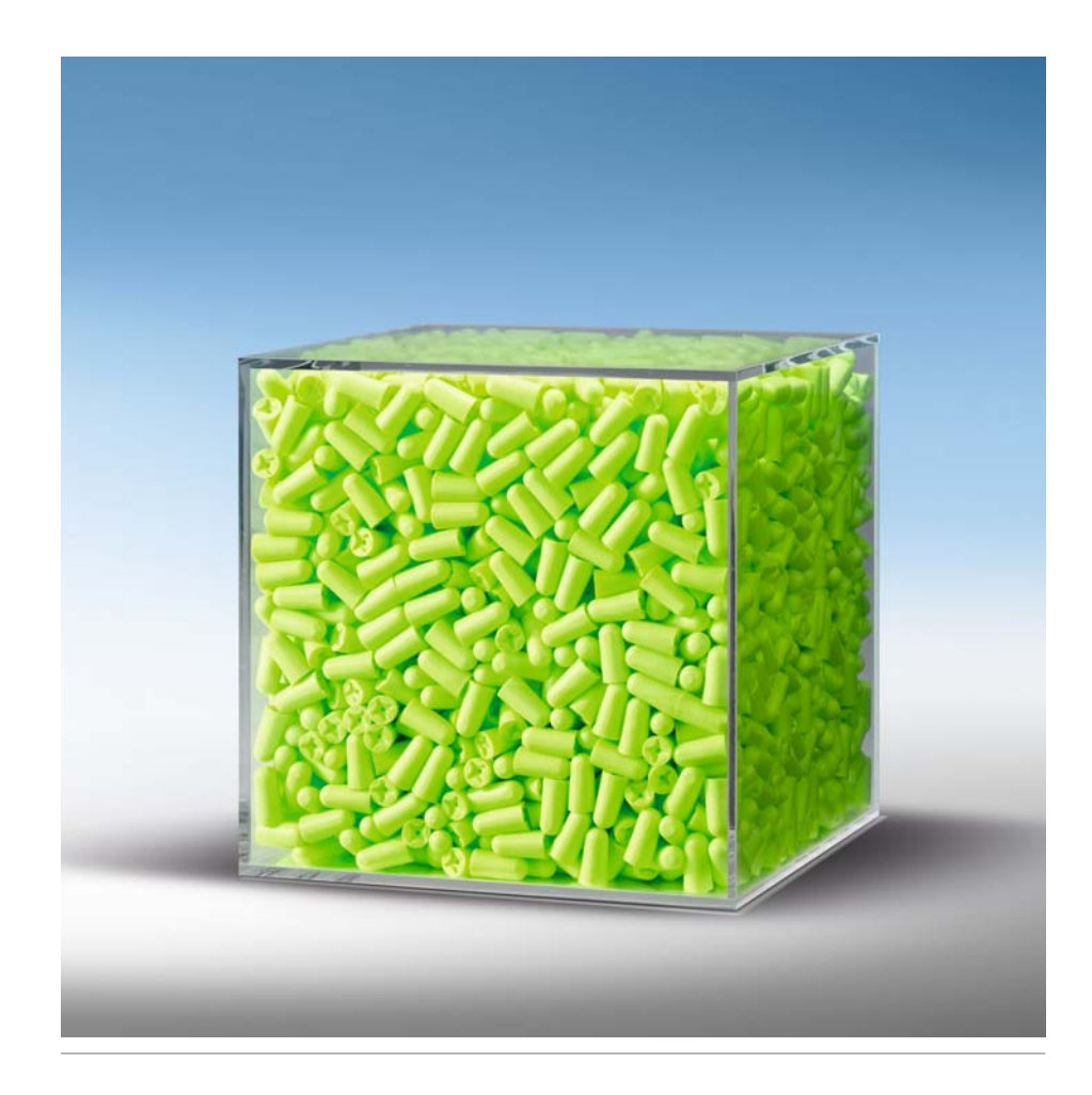
» Manufacturing1,000 pairs of earplugs ...