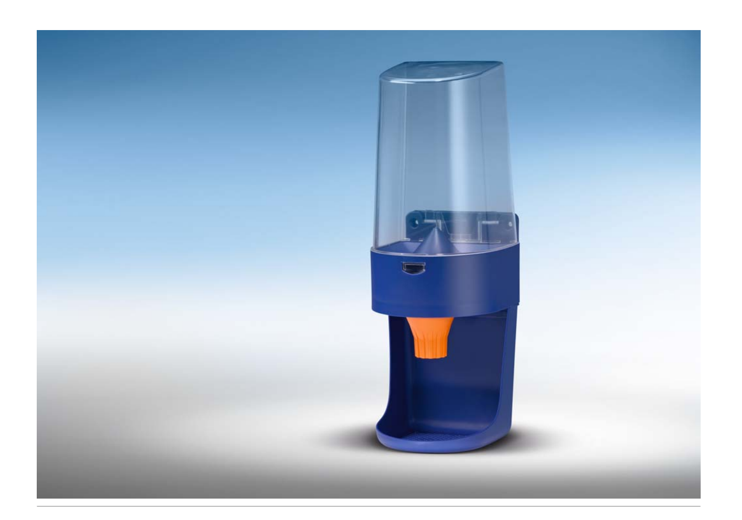
... helps protect the environment. «