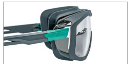
x-tended sideshield for additional side protection