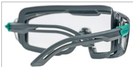
Ergonomically shaped side arms for a perfect fit and secure hold without creating pressure points