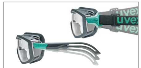
Three-stage adjustable side arms and headband for individual customisation