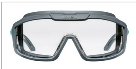
Flat lens design for an unrestricted field of vision

The uvex i-range planet can be used flexibly and makes an effective contribution to environmental protection – following our motto protecting planet .