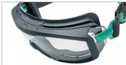
Soft and flexible face seal made from sustainable materials for a universal fit