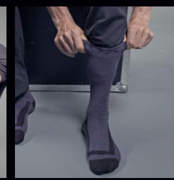
3. Pull socks over trousers