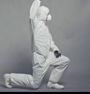
12. Stretch to ensure good fit and freedom of movement