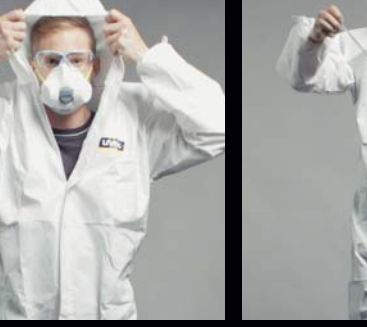
8. Put on breathing mask and goggles. Then pull over the hood 9. Close the coverall completely and remove the paper from the adhesive flap 10. Smooth out coverall and seal flap with adhesive tape