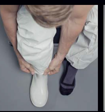
5. Put on rubber boots, pull coverall legs over rubber boots