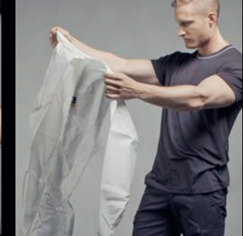
2. Open and check for damages