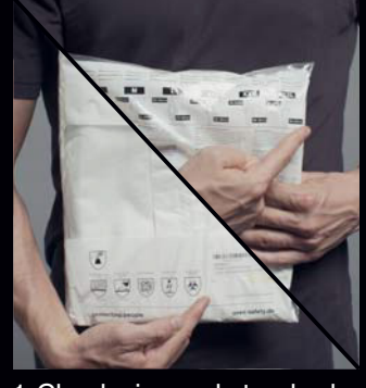
1. Check size and standards