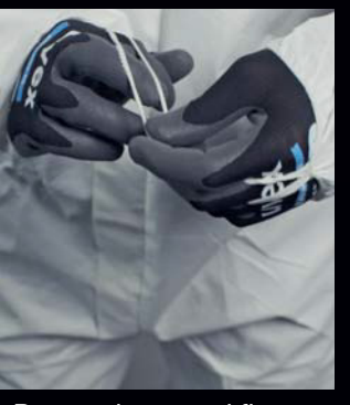
11. Put on gloves and finger loops