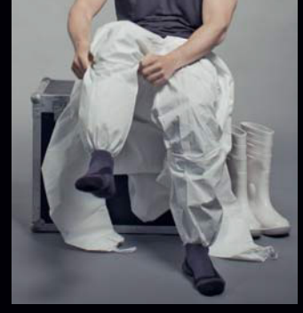
4. Climb into the legs of the coverall while sitting