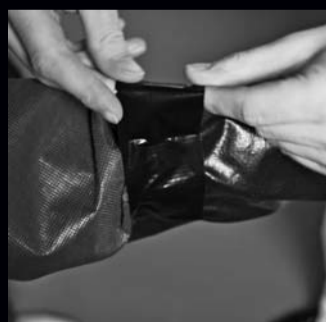
14. Tape the glove to the coverall. Fold in the ends of the tape for easier removal