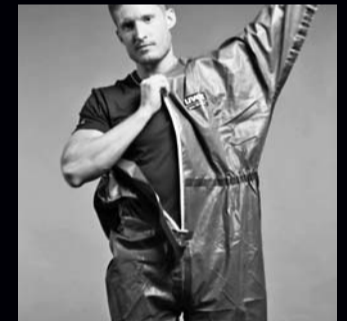
6. Stand up and put on the sleeves