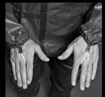
12. Put on finger loops