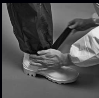
15. Tape the coverall leg to the boot