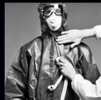
11. Smooth out coverall and seal flap with adhesive tape