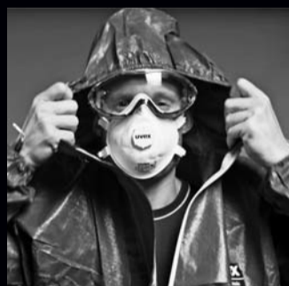
8. Put on breathing mask and goggles. Then pull over the hood