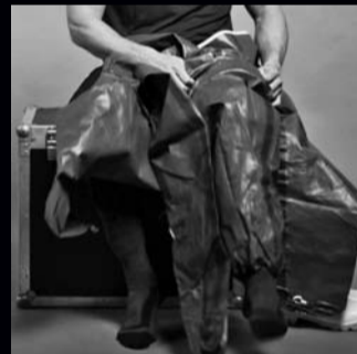
4. Climb into the legs of the coverall while sitting