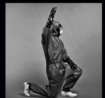
18. Stretch to ensure good fit and freedom of movement