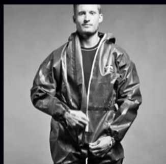
7. Close coverall up to the chest