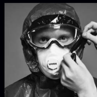
17. Tape the mask and goggle to the coverall