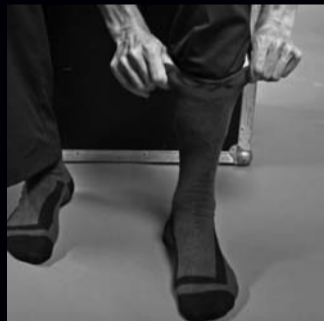
3. Pull socks over trousers