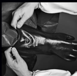
13. Put on gloves