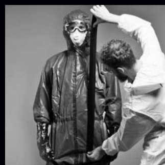
16. Additional taping of the flap