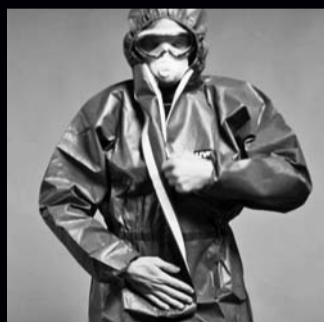
9. Close the coverall completely