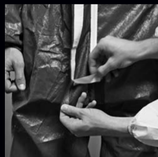
10. Remove the paper from the adhesive flap