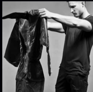
2. Open and check for damages