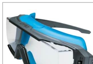
Panoramic lens with integrated side protection