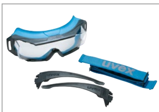
Hybrid system: Exchangeable headband and temples

The panoramic lens impresses with a wide field of view whereas at the same time the guard gives you best all-round protection. The soft, adaptive face seal is specially designed for an Asian fit. The uvex super OTG guard CB can also be worn above your prescription eyewear offering a solution for everyone.