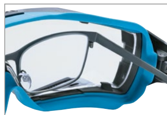
OTG compatible with frame recess for side arms