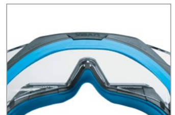
Soft, adaptive face seal