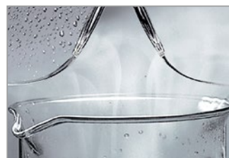
uvex supravision coating technology