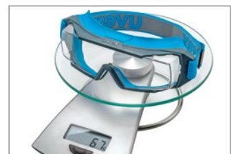
Light weight and compact eyewear