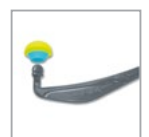
Art. no. 2125361