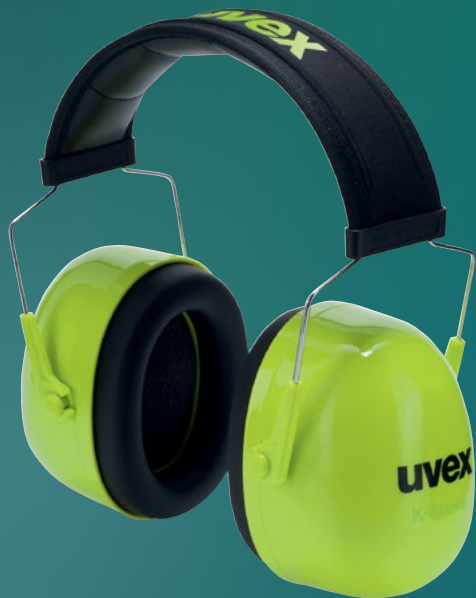
Art. no. 2600004

Extended exposure to high noise levels can lead to gradual, yet permanent and irreversible, hearing loss so it is imperative maritime workers have the appropriate hearing protection equipment. Easy-to-use hearing protection shields from noisy machinery, vehicles and moving parts such as shipping containers as well as helping with clear communication.