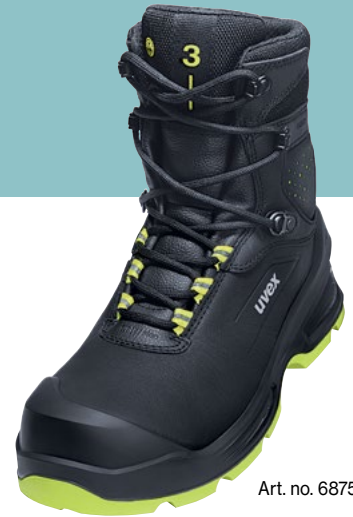
Art. no. 68752