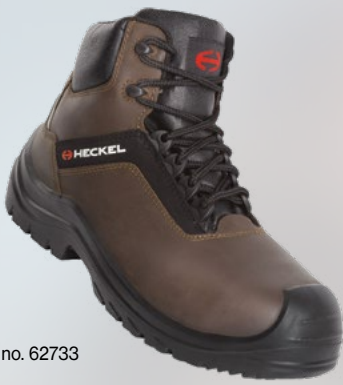
Art. no. 62733