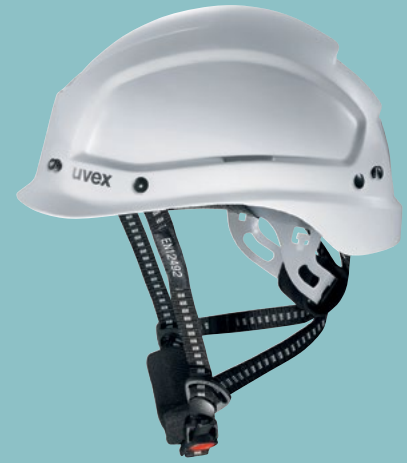
Art. no. 9773050