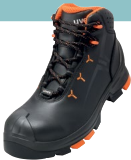
Art. no. 65032