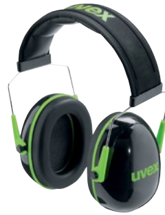
Art. no. 2600001