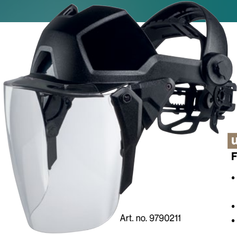
Art. no. 9790211

Working within the maritime industry can mean working in high-risk environments and accidents can happen. In 2022, 11.8% of deaths and injuries of merchant vessel crew were related to head injuries. Head injuries can be caused by falling objects, striking fixed objects or low ceilings in confined spaces. Between our helmet, faceguard and bump cap we have a variety of options to best support the head protection needs for your work circumstances.