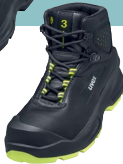
Art. no. 68722