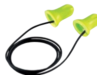
Art. no. 2112101