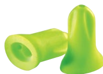
Art. no. 2112100