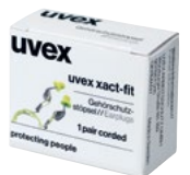
Art. no. 2124001