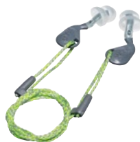
Art. no. 2124018