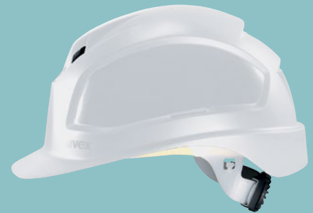
Art. no. 9772030