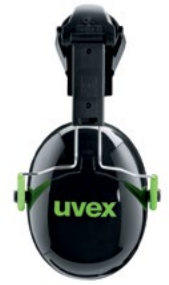
Art. no. 2600201