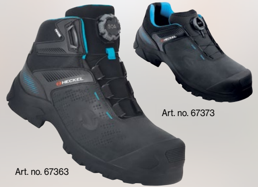
Art. no. 67373