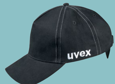
Art. no. 9794401