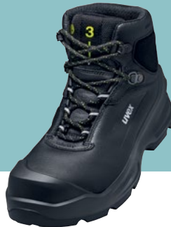
Art. no. 68742