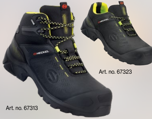
Art. no. 67323