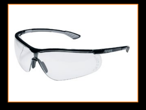
Feather-light with a weight of only 23 grams uvex sportstyle are significantly lighter than conventional safety spectacles giving optimised optical clarity and no pressure when wearing both products.