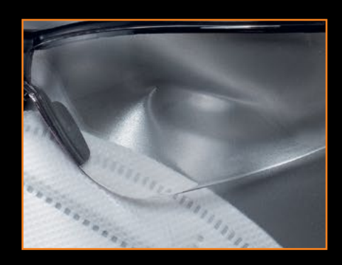
The spectacle lens sits outside of the mask ensuring no downward pressure dislodging the mask position.

* Alternative spec or goggle and mask options are available.