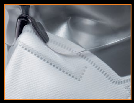
The 3D preformed mask shape gives an exceptional mask/face seal and the lens curvature reduces any gap between the eyes and the spectacle.