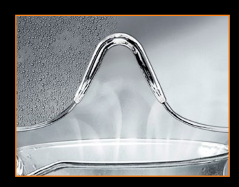
uvex unique anti-fog lens coating keeps the lens fog-free particularly during strenuous activity when body heat can intensify while wearing a mask. Applied to both sides of the lens.