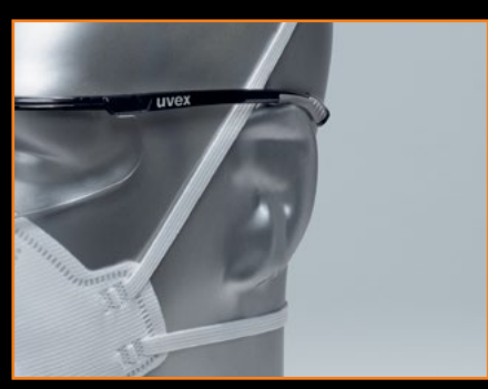
The low profile headband and ultra lightweight thin spectacle arm combination enhances compatibility with other items of PPE such as ear defenders and helmets.