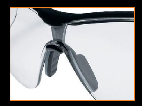
The uvex sportstyle boasts an adjustable nose piece and soft anti-slip ear pieces (uvex duo component technology) ensuring a pressure-free fit. The wearer is able to maintain the exact position of the spec and mask even during strenuous tasks.