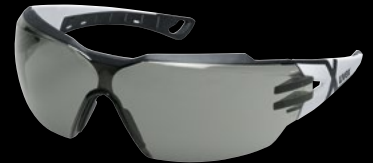
Product code 9198237