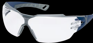
Product code 9198257