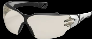
Product code 9198064