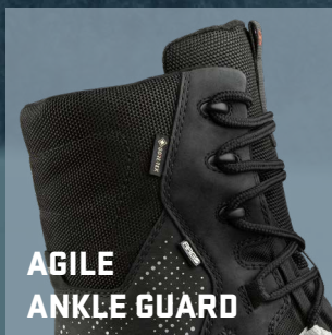
AGILE ANKLE GUARD