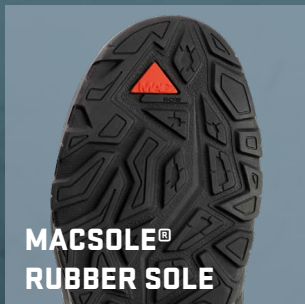
MACSOLE® RUBBER SOLE