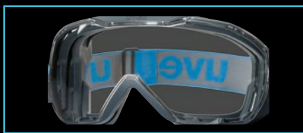
Frameless and innovative lens design for an optimum, unrestricted view

every wearer, even with their own prescription glasses, to wear the product with enthusiasm and without restrictions. Their sporty, ergonomic design and extremely comfortable fit make them a reliable companion during your everyday work.