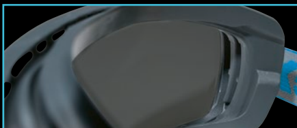
Fits comfortably over most prescription glasses thanks to the unique frame design