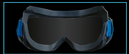
Ergonomic face seal for a perfect fit and maximum comfort