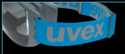
Extra-wide headband for an optimal fit and enhanced wearer comfort