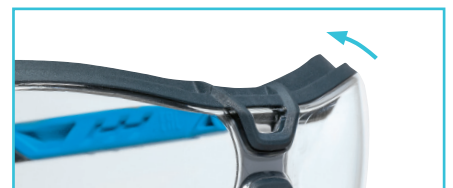
x-tended eyeshield provides greater protection against particles, dust and dirt