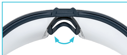
Soft and flexible nose pad for pressure-free wearer comfort and a non-slip fit