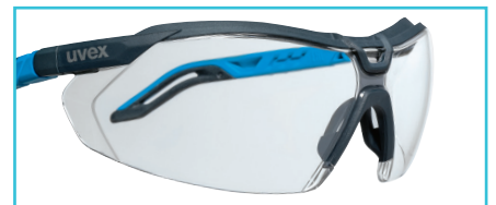
uvex supravision coating technology