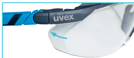
x-tended sideshield provides optimum protection around the sides of the eyes