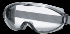
Product code 9302281