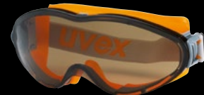
Product code 9302247