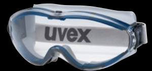
Product code 9302600