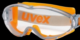
Product code 9302245