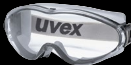
Product code 9302285