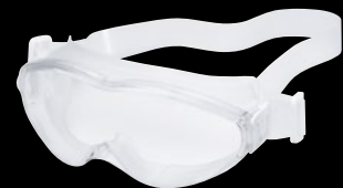
Product code 9302500

uvex supravision clean Lens and frame are autoclavable and resistant to chemicals. Lens is anti-fog on the inside and extremely scratch-resistant on the outside. The anti-fog properties last for at least 10 autoclave cycles.