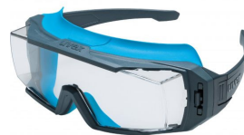
uvex super OTG guard CB with temples Article no. 9142100