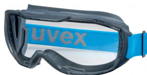
uvex megasonic clear lens Article no. 9320466