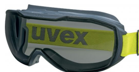
uvex megasonic grey lens Article no. 9320481