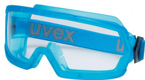
uvex hypervision CB Article no. 9167602