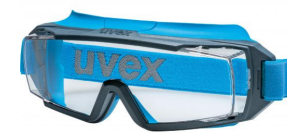
uvex super OTG guard CB with headband Article no. 9142103