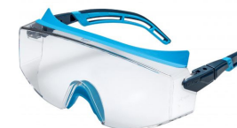
uvex OTG SN CB Article no. 9167602