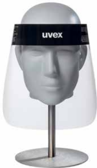
9710-514 front view