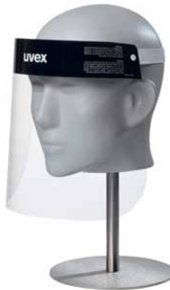
9710-514 side view